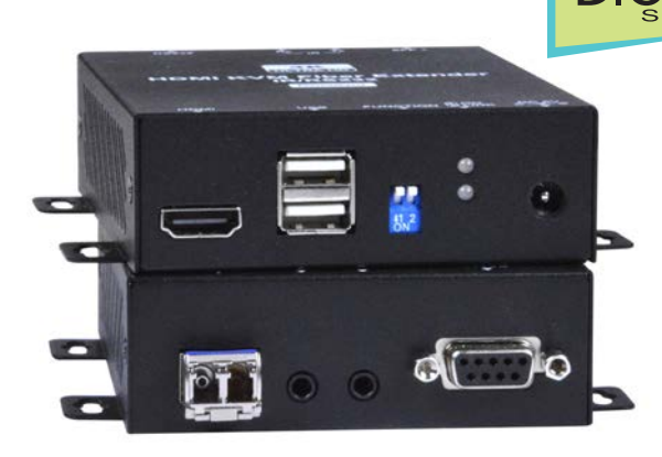
ST-FOUSB4K18GB-LC (Remote and Local Units)