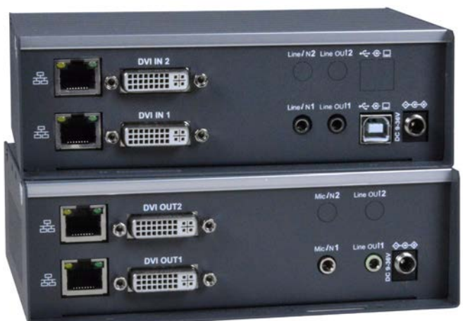
XTENDEX® ST-IPUSBD-DH (Local & Remote Units)