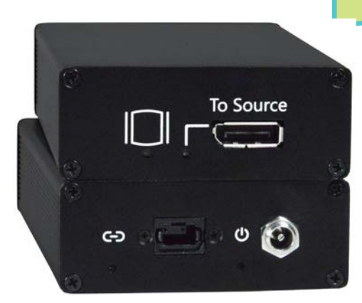
ST-FODP14-MPO (Remote and Local Units)